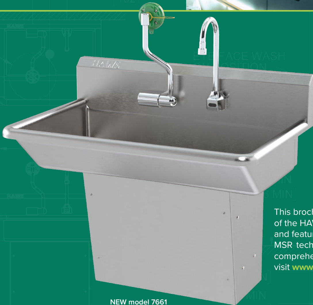
NEW model 7661 Hand Wash Sink with AXION® Eye/face Wash

This brochure represents some of the HAWES® lab products, and features the AXION® MSR technology. For more comprehensive list of products, visit www.hawesco.com .