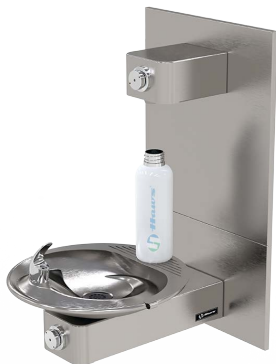
1001-1920 with BTL1001