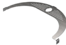
14-5/8" x 8-5/16" x 1/2"

BTL1001 add-on bottle stand for the 1001/1011 series drinking fountains with the 1920 bottle filler installed. Stand is 304 stainless-steel with a satin finish.