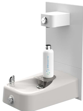
1311-1920W with BTL1311