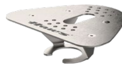
5-7/8" x 4-3/4" x 1-9/16"