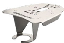
5-1/8" x 5-3/4" x 2-7/16"

BTL1311 add-on bottle stand for the 1311/1501 series drinking fountains with the 1920 bottle filler installed. Stand is 304 stainless-steel with a gloss-white powder coat finish.