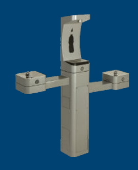
3612F OUTDOOR FILTERED BOTTLE FILLER & DRINKING FOUNTAIN