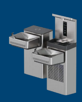
1212SF HI-LO FILTERED ELECTRIC WATER COOLER & BOTTLE FILLER