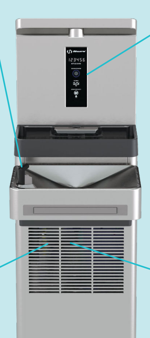
1211SF model shown