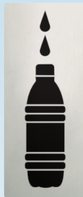
custom logo panel example