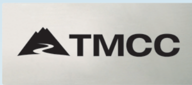
custom logo panel example