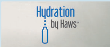
standard logo panel, model 6475

Customize your new or existing drinking fountain or bottle filler with your choice of logo, slogan, or graphic! Increase brand recognition with personalization options and an easy to retrofit custom panel.