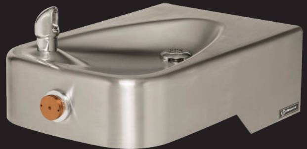
1107L w/PBA6C button kit