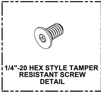
1/4"-20 HEX STYLE TAMPER RESISTANT SCREW DETAIL