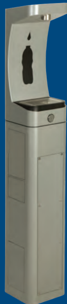
Model 3610 Outdoor ADA pedestal with one bottle filler