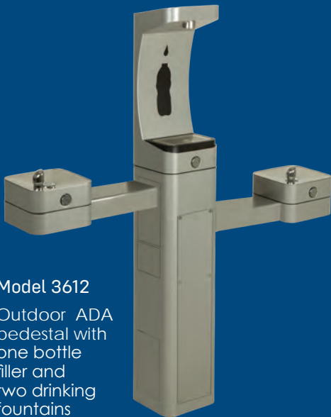
Model 3612 Outdoor ADA pedestal with one bottle filler and two drinking fountains