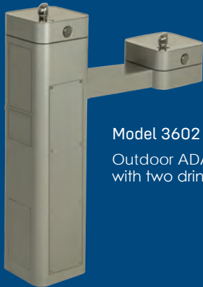
Model 3602 Outdoor ADA pedestal with two drinking fountains