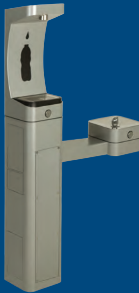
Model 3611 Outdoor ADA pedestal with one bottle filler and one drinking fountain