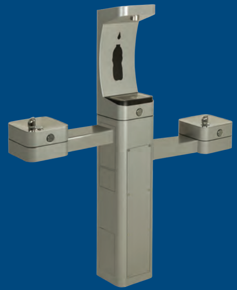
Model 3612 Outdoor ADA pedestal with one bottle filler and two drinking fountains