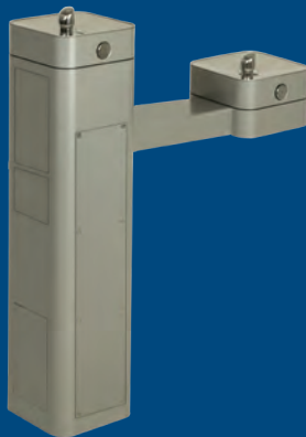
Model 3602 Outdoor ADA pedestal with two drinking fountains