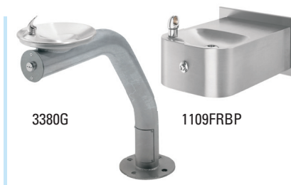
Metal Fountains (Pedestal and Wall)