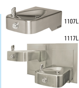
Easy Adjust Family