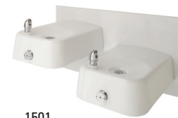
Enameled Iron, Cast Iron, and Aluminum